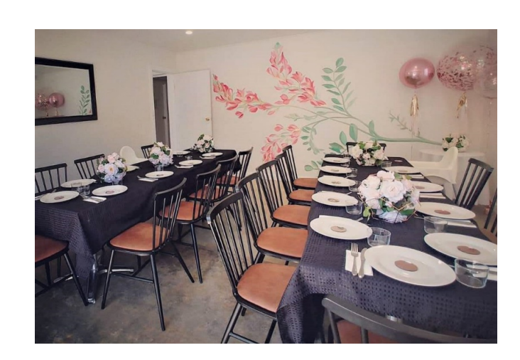
SAHA Room – formal sit-down lunch

Drinks can be charged on consumption by running a TAB at the time (e.g. request juice, soft drink, sparkling water, coffee and tea.